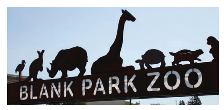
Virtual Zoo Tour Wednesday, November 25, at 10am, via Zoom Registration Required *

Presented in partnership with the Ames Public Library and Ames Pride. Sponsored by The Project of Primary Healthcare.